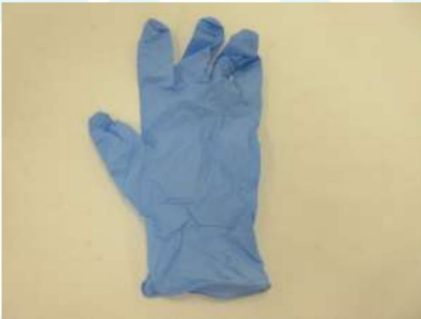
Samples described as MNEPF1 - BPG Nitrile Examination Gloves Powder-free